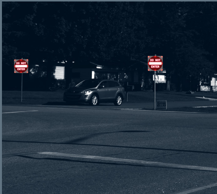
PERPENDICULAR OR OFFSET ANGLES