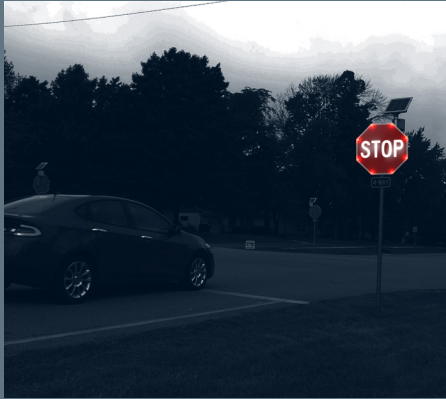
LOW AMBIENT LIGHT CONDITIONS