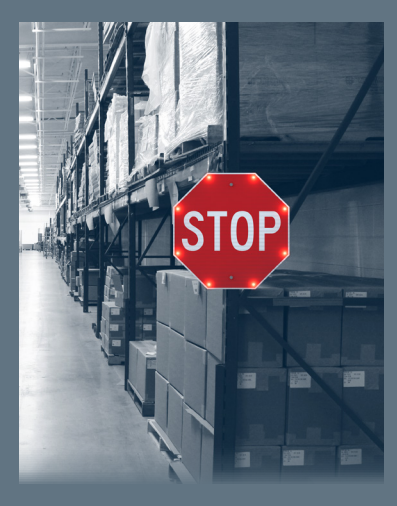
WAREHOUSE RACK MOUNT