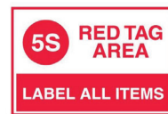
81221 Red Tag Area Wall Signs