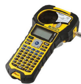
BMPP1 Brady BMP21 PLUS Label Printer