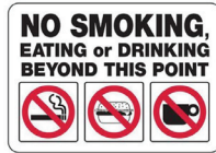
40839 Housekeeping Signs