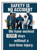
DAD49 Motivational Safety Scoreboards