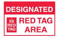
81219 Red Tag Area Wall Signs