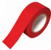
FTAP10-RD Red Floor Marking Tape