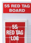
RTBC1 Red Tag Stations