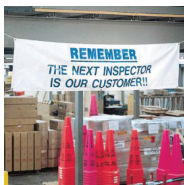
VSB437 Custom Vinyl Banners