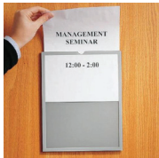
8356003 Notice Holders