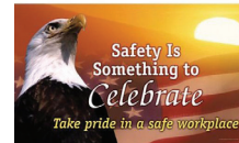
AC0416 Communication Boards