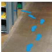
CAY1316 Removable Footprints