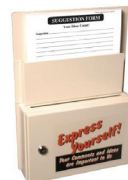
CDESS22 Safety Suggestion Boxes