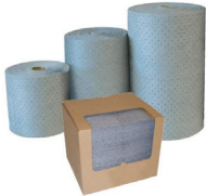
663 Sorbent Pads & Rolls