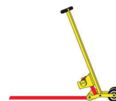
AMM412 Aisle Marking Tape Machine