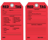
MM0019 Red Tags