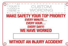
81288 Custom Dry Erase Safety Tracker Signs