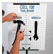
SHBTP Shadow Board Tool Tape