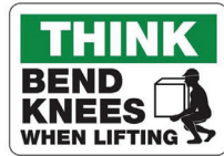
PT25A Injury Prevention Signs