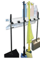
AA099 Mop and Broom Holder