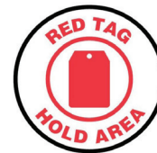
JFD58 Red Tag Hold Area Floor Signs