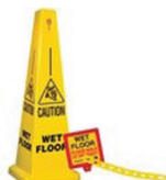
Floor Safety Cones and Accessories