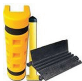
Bumper and Cable Protectors