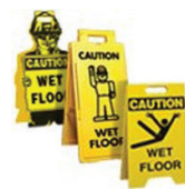
Portable Floor Stands