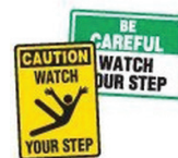
Slipping and Tripping Signs