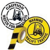
Floor Tapes, Stencils and Decals